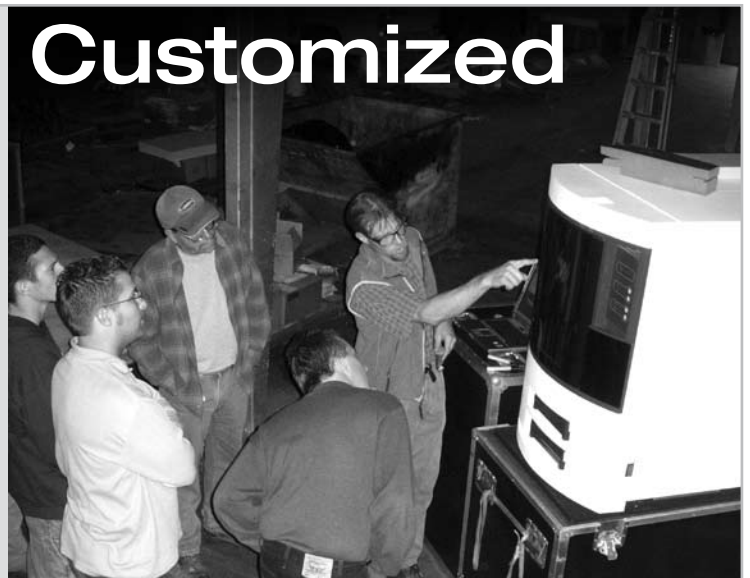
EAS staff watches a part being made in the CACT Rapid Prototype Printer.